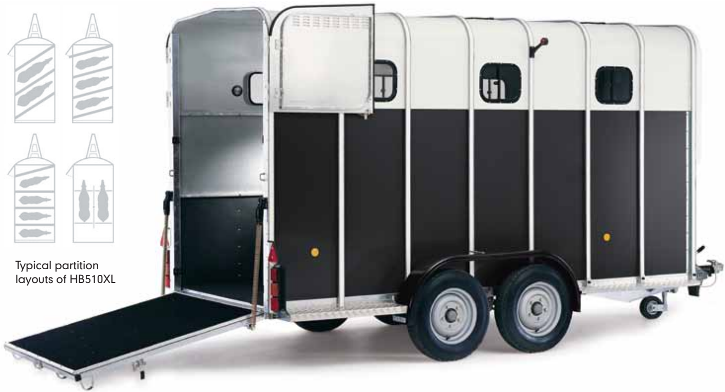
Typical partition layouts of HB510XL